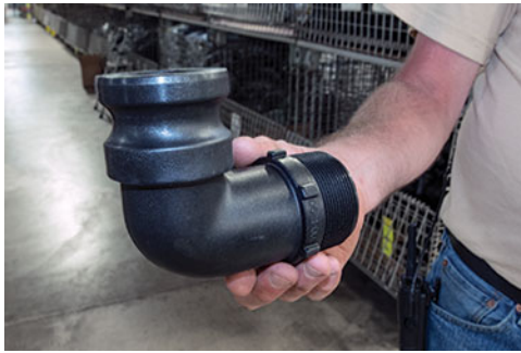
Banjo Corporation manufactures fittings, couplings, valves, pumps and other industrial and agricultural liquid-handling products from tough fiber-reinforced polypropylene.