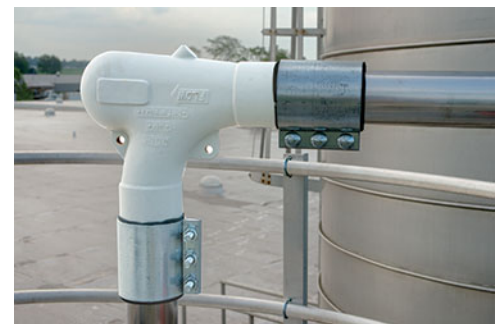
Gasketed couplings connect pneumatic lines to the socket-weld deflection elbows.