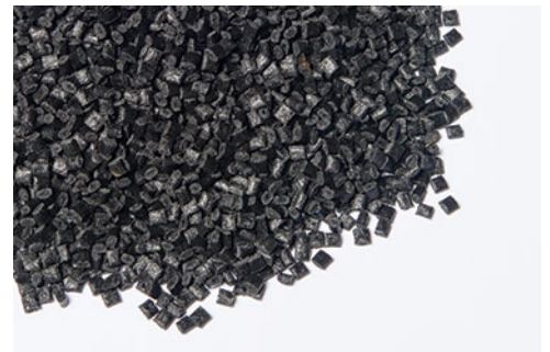
Abrasive wear from glass-fiber-reinforced polypropylene pellets impacting the wall of sweep elbows was prevented by installing non-impact deflection elbows from HammerTek Corp.