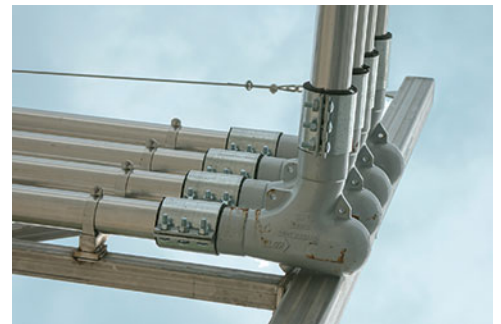
Smart Elbow® deflection elbows replaced conventional sweep elbows, reducing maintenance cost and downtime.